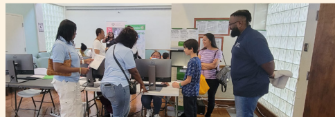
Back-to-School Immunization Fair held August 10, where we provided immunizations and oral health screenings to uninsured patients, along with backpacks and school supplies to help prepare students for the school year.