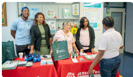
In recognition of Men's Health Month in June, JTCHS hosted a Health and Wellness Fair at the JTCHS Frederica Wilson/ Juanita Mann Center. Pictured are JTCHS community outreach staff members engaging with fair attendees.