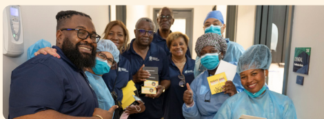
During National Health Center Week, the JTCHS executive board visited all JTCHS locations and presented Night Owl cookies and thank-you cards to staff, recognizing their exceptional commitment and hard work.