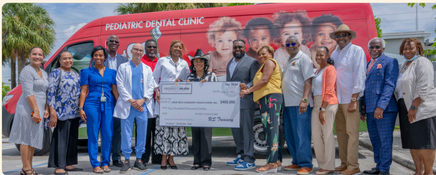
During National Health Center Week, celebrated August 4-10, 2024, the Honorable Congresswoman Frederica S. Wilson (FL-24) (center) presented a $400,000 check to Jessie Trice Community Health System (JTCHS) for a pediatric medical van and a pediatric dental Van to support children in South Florida.