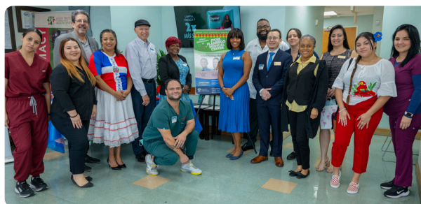
In Celebration of Hispanic Heritage Month, JTCHS hosted a meet-and-greet, at the JTCHS Flamingo Medical Center in Hialeah. The event featured a tour of the facility and insights into the diverse healthcare services provided by JTCHS.